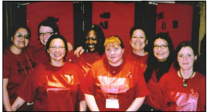
Past and current participants and program coordinators of the Women's Wellness Program after a performance of the Viral Monologues — a theatre performance of the stories of women living with HIV/AIDS.

The program has been successful because it works at the grass roots level and addresses the needs of the AIDS community. It fills a gap in addiction ser-