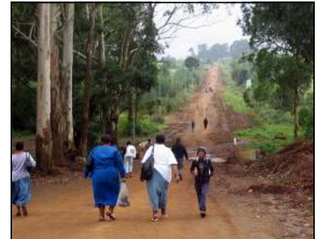
The long walk home from downtown Libode