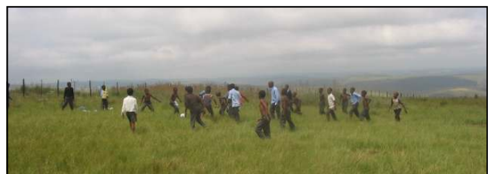
Children playing soccer with balls donated by Victorian soccer leagues.

Thanks to the generosity of the South Island Classics Soccer Association, Lower Island Soccer Association, and Soccerworld in Victoria, AVI was able to bring soccer balls and pumps to 15 schools in Libode.